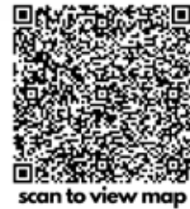
scan to view map

Your meal wrist band must be worn. Breakfast - 6.00-6.45 am Lunch - Dirt riders only to pack lunch Road Riders Pack eating utensils only