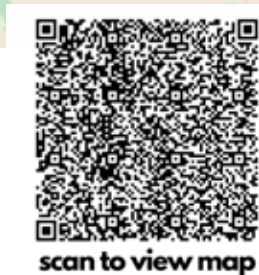
scan to view map